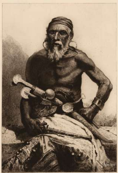
Pirate Huff about the Huff about the