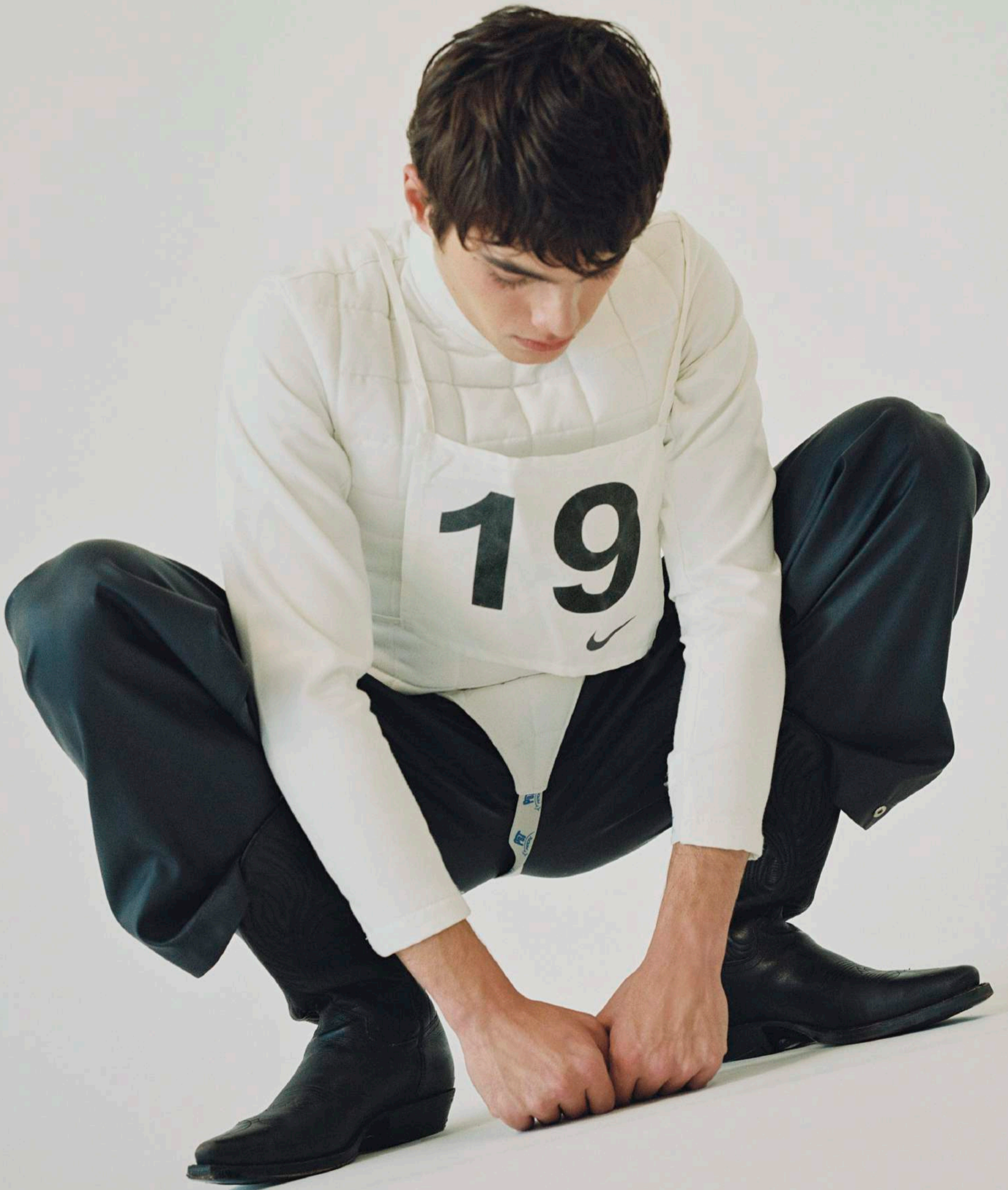
Fencing jacket and guard ALLSTAR Vest NIKE Cowboy boots TONY MORA