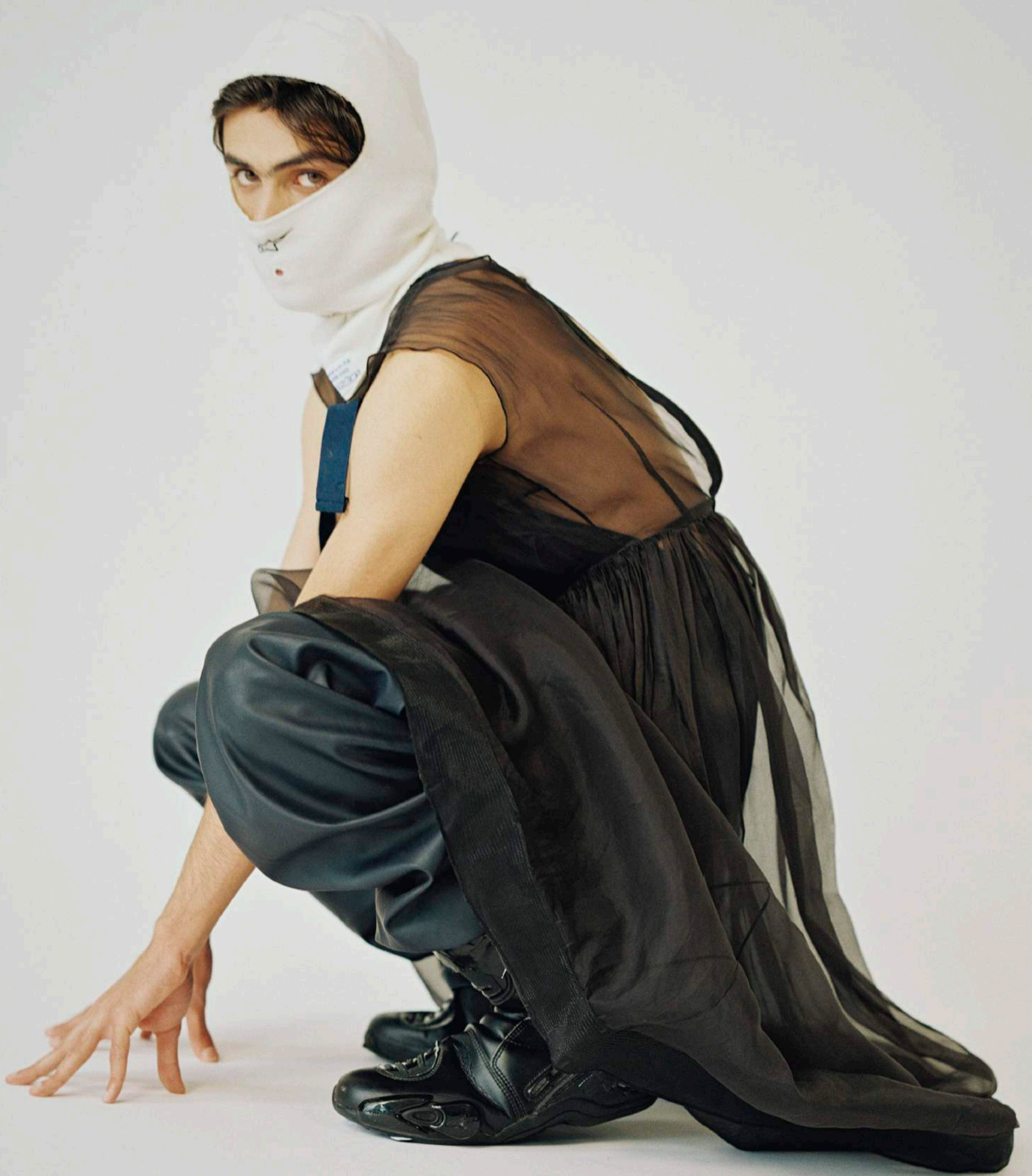
Fishing pants and dress VINTAGE Haad sock and boots ALPINESTARS