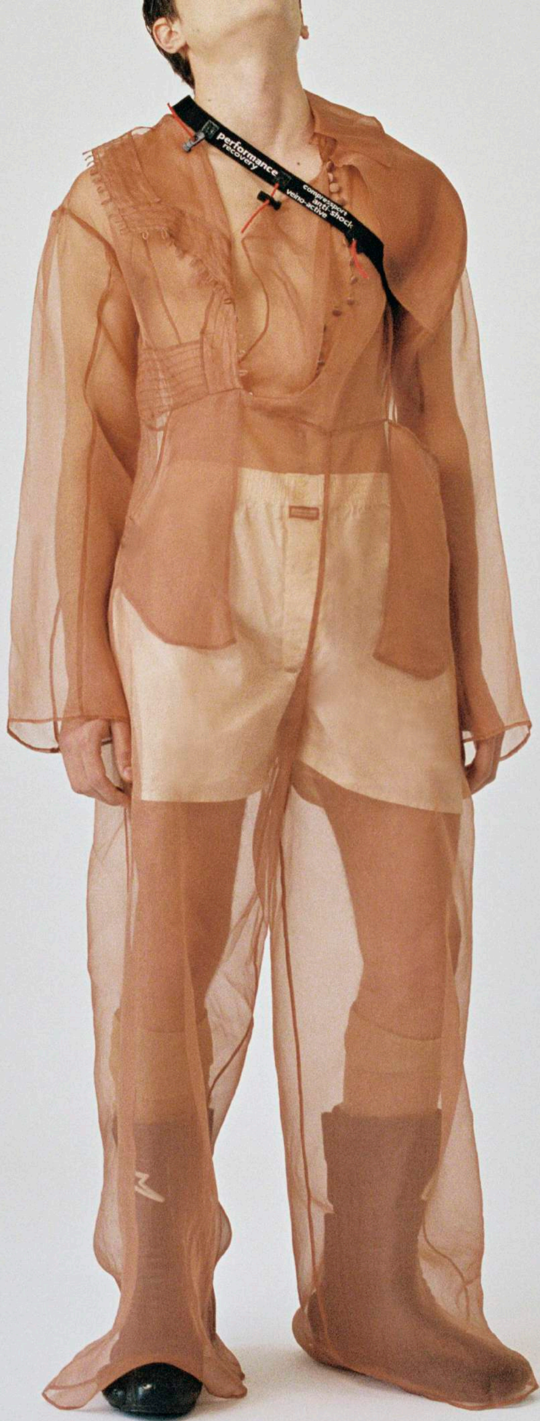
Mesh jumpsuit LUCIANA CABRALES - Boxer EMIDIO TUCCI - Boots ALPINESTARS