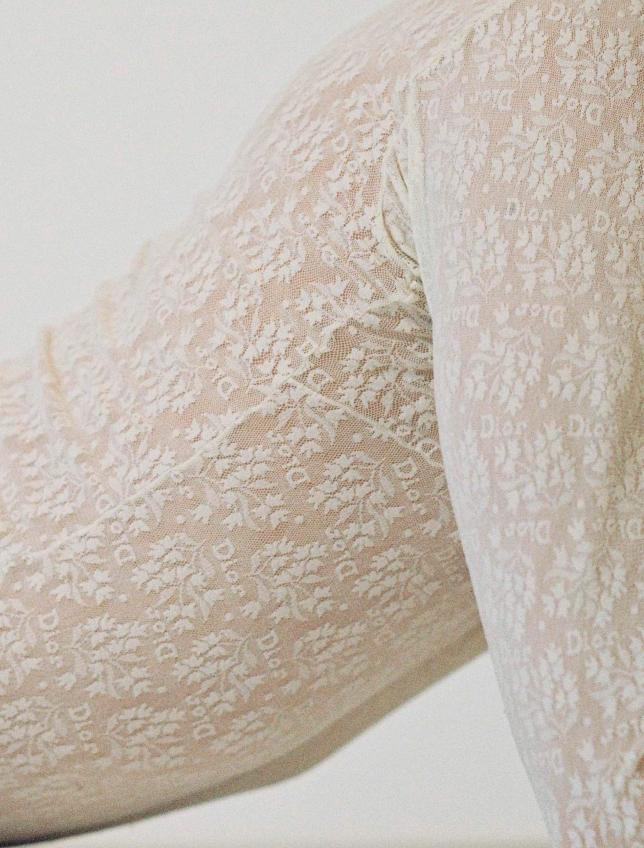
Patchwork leather pants VINTAGE Mesh top DIOR