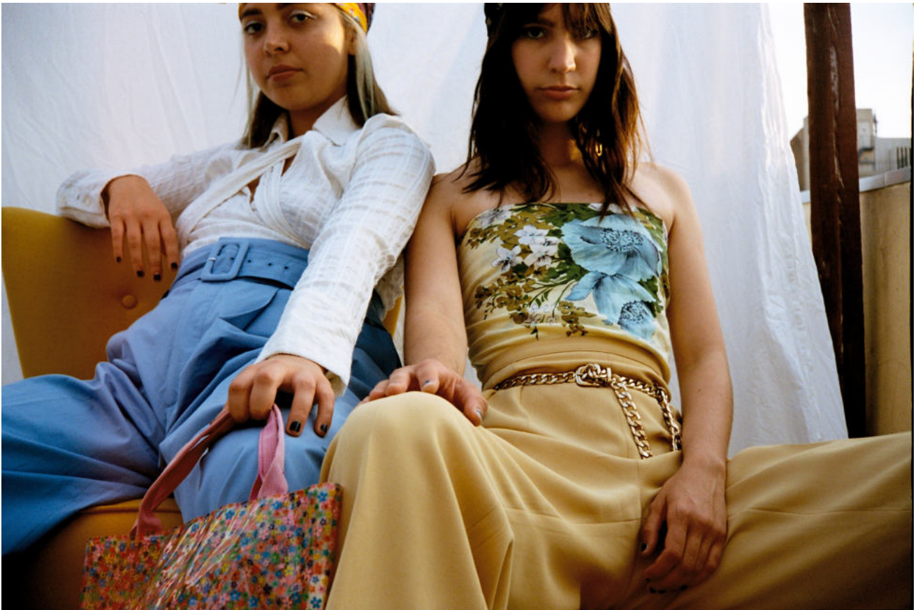
Camisa Blanca VINTAGE; Pantalón Azul ZARA; Bolso Flores Transparente VINTAGE; Pañuelo Amarillo GUCCI; Pantalón Amarillo VINTAGE; Pañuelo como Top VINTAGE; Cinturón Cadena VINTAGE.