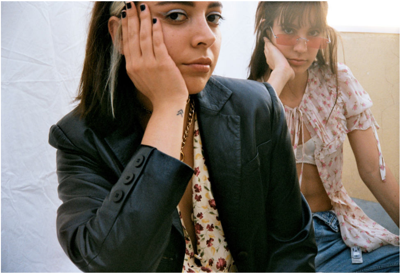
Americana Piel VINTAGE, Vestido Flores VINTAGE; Gafas Cristal Rosa BERSHKA, Camisón Flores VINTAGE, Jeans LEVI'S