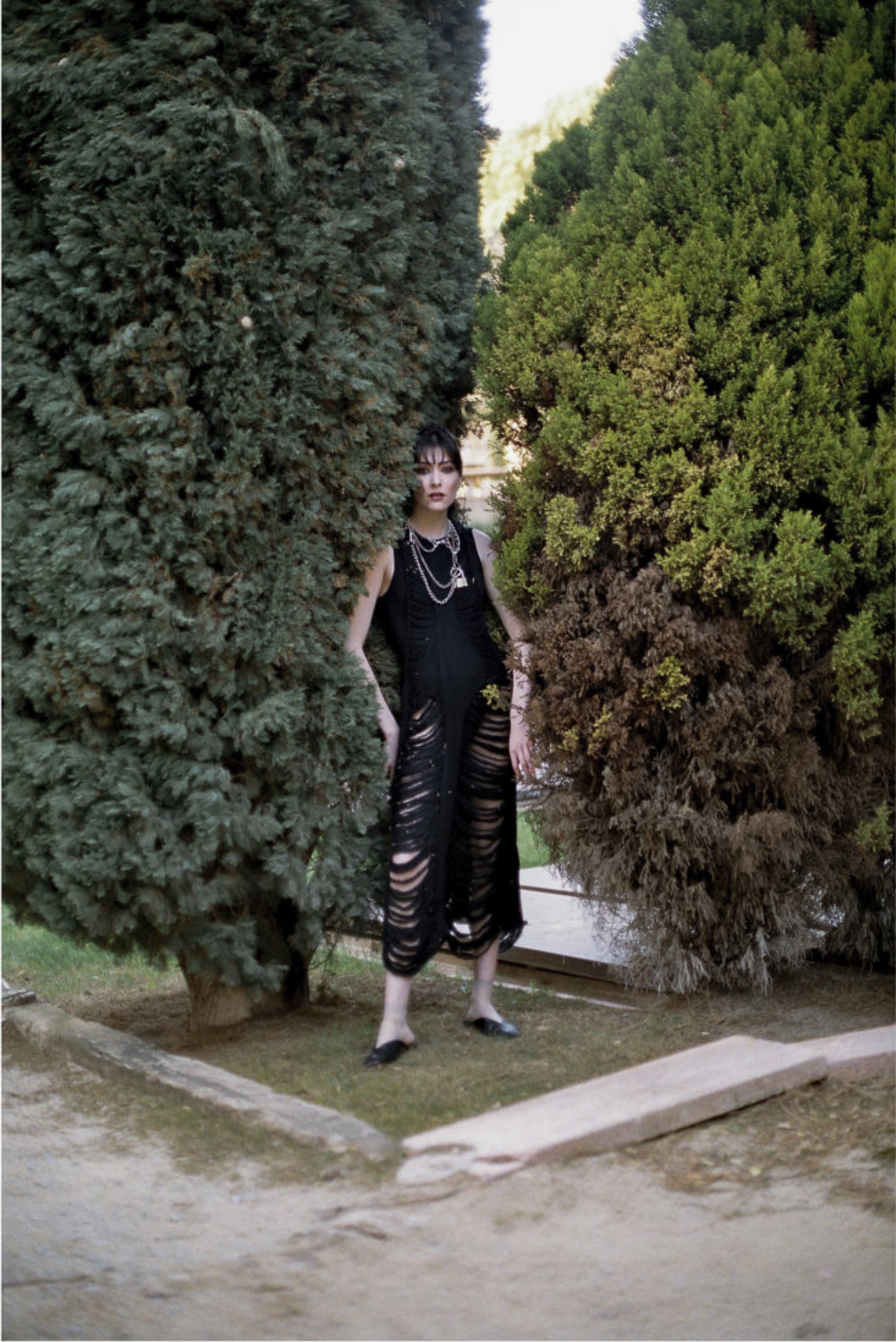
Mar wears frayed knit black dress by Joana de Plancell with black bodysuit underneath & vintage black slide shoes. Silver chains with lock and key, stylist's archive.