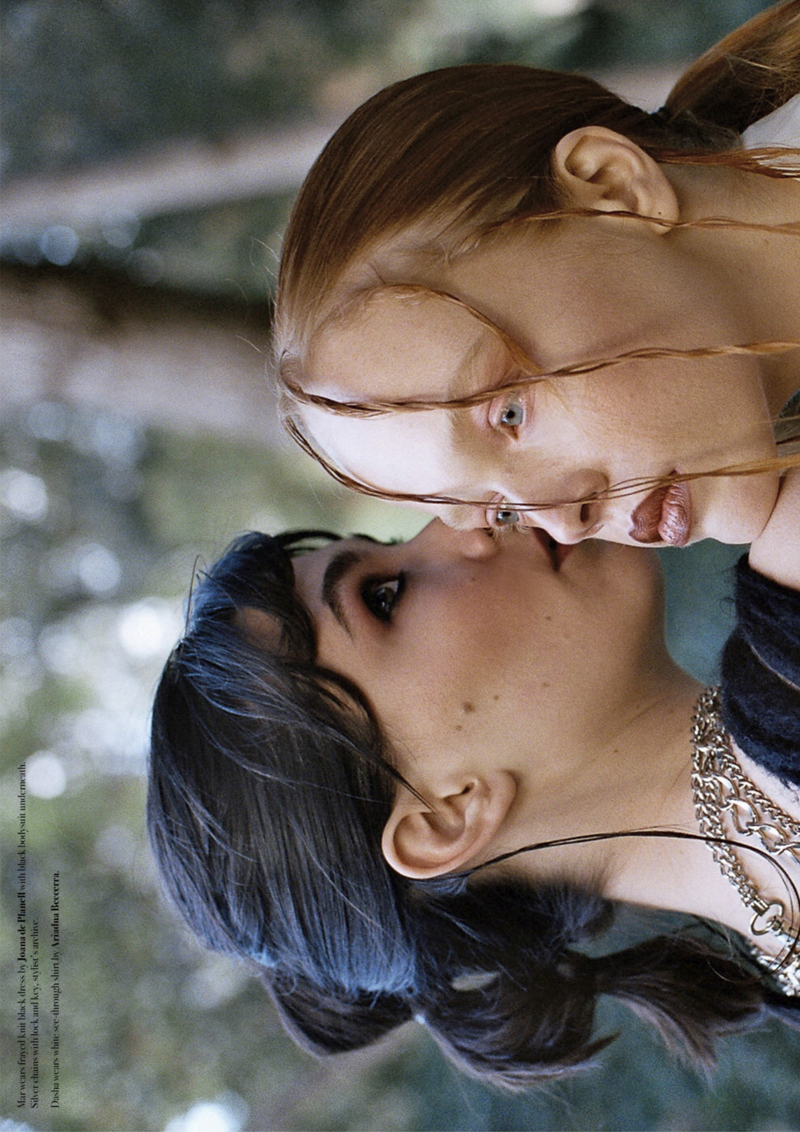
Mar wears frayed knit black dress by Joana de Pianell with black bodysuit underneath. Silver chains with lock and key, stylist's archive.